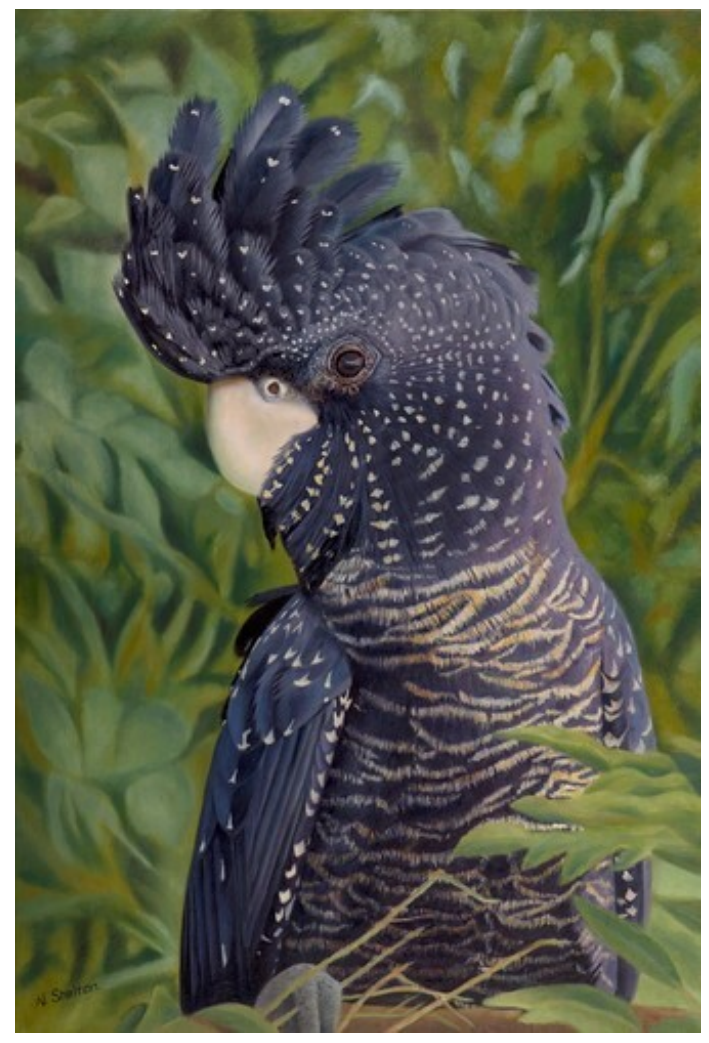
"Nelly – Redtailed Black Cockatoo" oil on canvas, 61cm x 91cm

Others are portraits where the subject sits regally and is almost posing for the piece like the royalty they are. My goal with each piece is to have it jump from the canvas into the viewer's own reality.