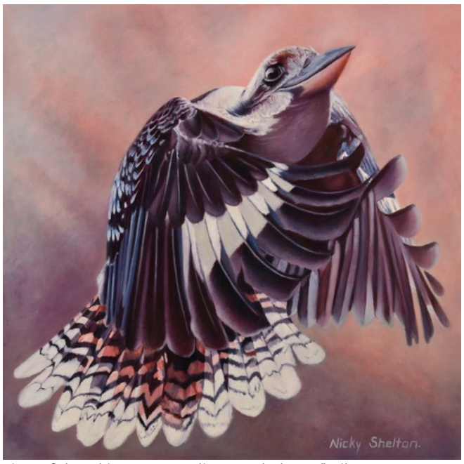
"Maverick King of the Skies - Australian Kookaburra" oil on canvas, 75cm x 75cm

I describe my style as "contemporary realism" as I do not wish to change the beauty of my subjects but bring them into focus against contemporary backgrounds. Some are situational such as a sea eagle hunting or a cockatoo enjoying a snack.