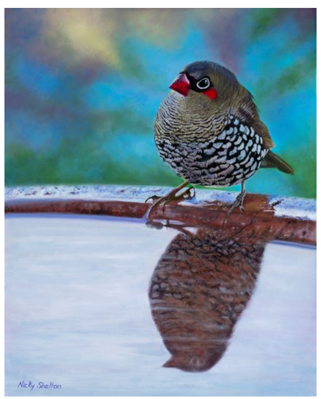
"Rudy's Reflection – Redeared Firetail Finch" oil on canvas, 61cm x 76cm

I describe my style as "contemporary realism" as I do not wish to change the beauty of my subjects but bring them into focus against contemporary backgrounds. Some are situational such as a sea eagle hunting or a cockatoo enjoying a snack.