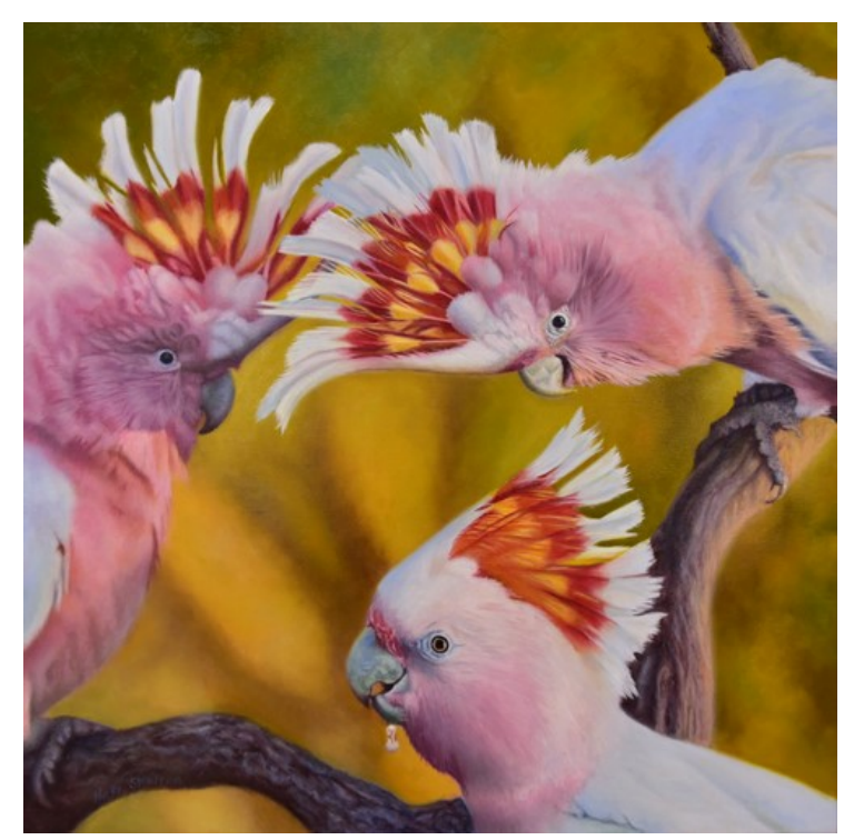
"Triple Treat – Major Mitchell Cockatoos" oil on canvas, 75cm x 75cm

I have always loved birds, and feel blessed to live in the South West of Australia where we have a wonderful variety of bird life that changes through the seasons.