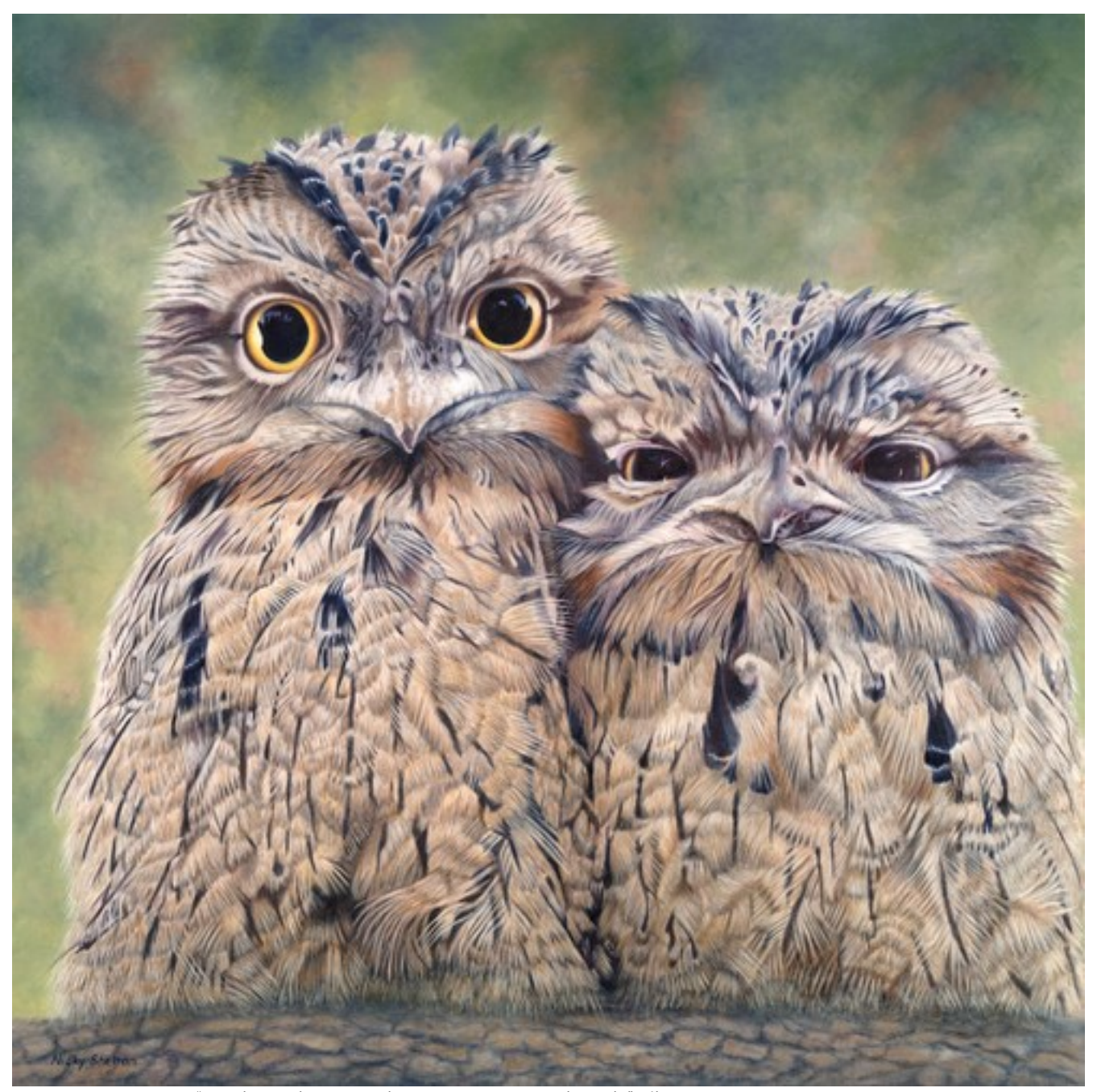
"Sparky and Gus – Baby Tawny Frogmouth Owls" oil on canvas, 120cm x 120cm

At this point I have won a few awards, been jury selected as a finalist in a number of prestigious competitions and had a successful solo exhibition. I can probably no longer call myself an emerging artist—but there is much more to come.