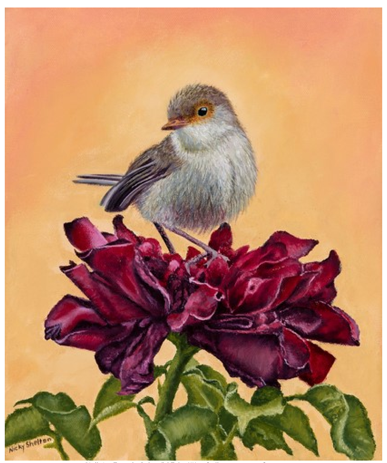
"Juliet – Female Splendid Fairy Wren" oil on canvas, 26cm x 31cm

Many endangered species live only in our special part of the world. I do my little bit to help protect them, with a percentage of every original painting sold being donated to Birdlife Australia.