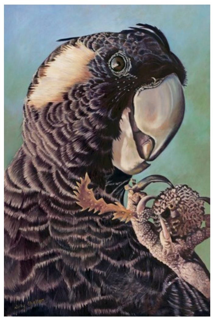
"Edwina's Luncheon Orb – Baudins Black Cockatoo" oil on canvas, 61cm x 91cm